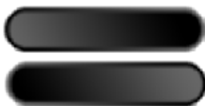
Pill 3 Med [depr].bmp