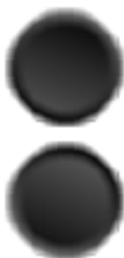
Pill 0 Lg [depr].bmp