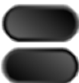
Pill 1 Lg [depr].bmp