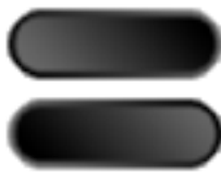
Pill 2 Sm [depr].bmp