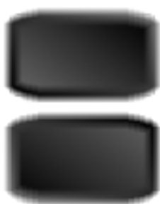
Pill 10 Lg [depr].bmp