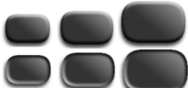
Big Btn 4 [n] [depr].bmp (45, 53, 65)