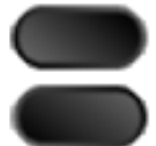
Pill 1 Sm [depr].bmp