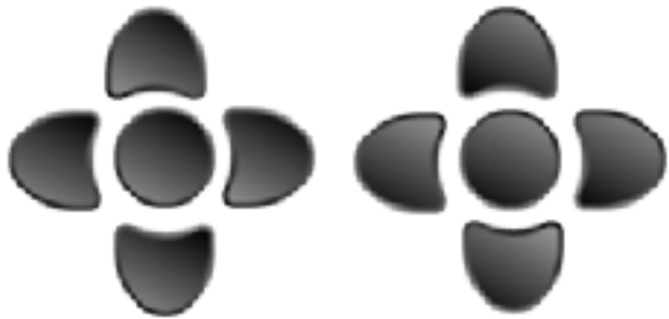
Nav 1 Med [x] [depr].bmp (Center, Up, Dn, Left, Right)