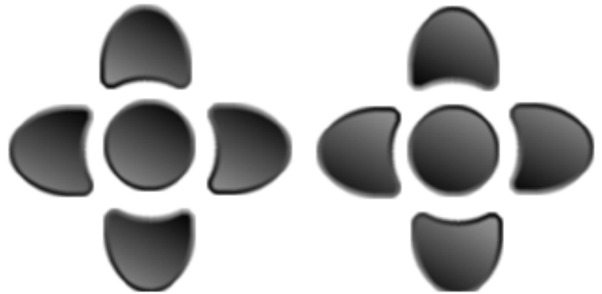
Nav 1 Lg [x] [depr].bmp (Center, Up, Dn, Left, Right)