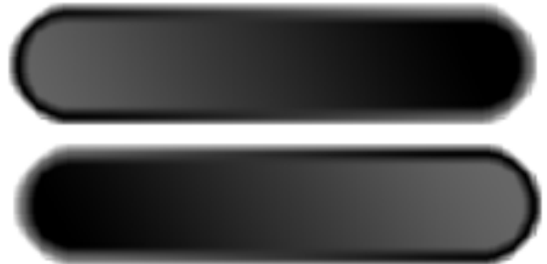
Pill 3 Lg [depr].bmp