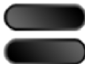
Pill 2 Med [depr].bmp