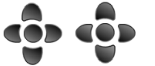
Nav 1 Sm [x] [depr].bmp (Center, Up, Down, Left, Right)