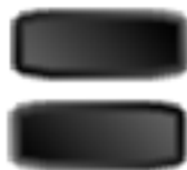
Pill 11 Sm [depr].bmp