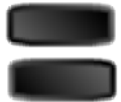
Pill 11 Med [depr].bmp