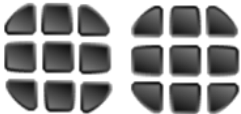
Nav 2 Sm [x] [depr].bmp (Center, Left, Right, Up, Down) Nav 2 Sm [y] Corner [depr].bmp (UL, LR, LL, LR)