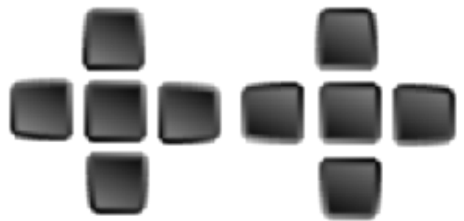
(Same, but shown without corners)