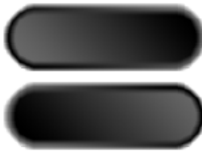
Pill 2 Lg [depr].bmp