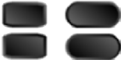
Pill 10 Med [depr].bmp